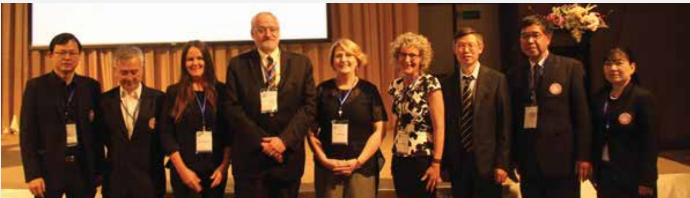
TSRM executive board and international speakers