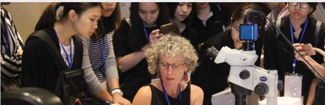
Workshop I : Oocyte cryopreservation workshop | Workshop II : Ovarian tissue freezing